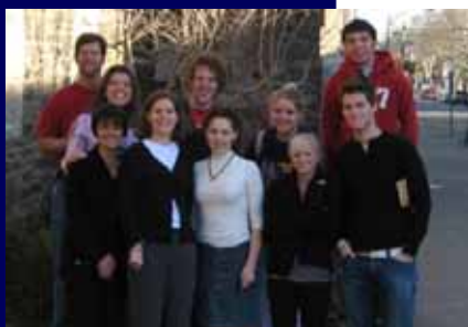
Winter Service Trip '07

"...we reflected on how we are each lights and how we can live out this life as college students."