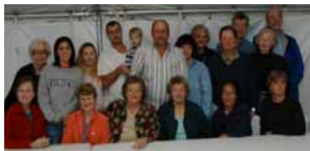
Group from Westminster Presbyterian

Early in January I was fortunate enough to travel to Pearlinton, MS to aid the Katrina Relief effort with the Presbyterian Disaster Assistance (PDA) organization. I set out with ten members of Westminster Presbyterian Church, the church I attend when at school in Charlottesville, VA.