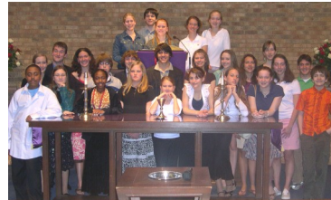
Bush Hill Youth on Youth Sunday

At Bush Hill Presbyterian Church, there are many ways in which you can become involved in the life of the church. Listed below are some of the different ministries offered. Please contact the church office or visit our website for more information.