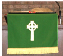
Bush Hill is a member of PC(USA)

During the second service (and the single summer service), children three-years-old through Kindergarten age may go to Enrichment Classes following the Children's Message.