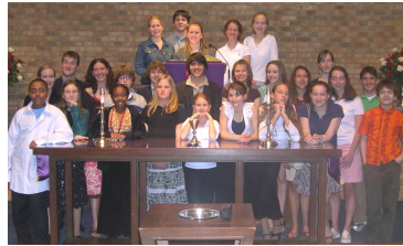
Bush Hill Youth on Youth Sunday

At Bush Hill Presbyterian Church, there are many ways in which you can become involved in the life of the church. Listed below are some of the different ministries offered. Please contact the church office or visit our website for more information.