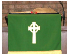
Bush Hill is a member of PC(USA)

During the second service (and the single summer service), children three-years-old through Kindergarten age may go to Enrichment Classes following the Children's Message.